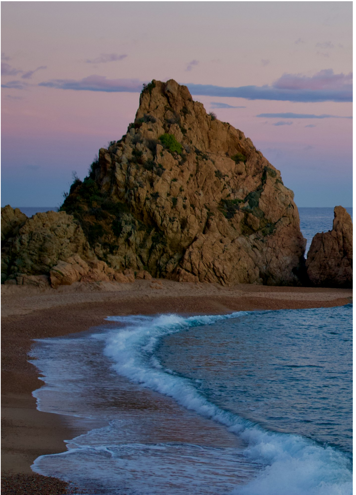
A secluded cala (cove) along the Costa Brava near Tossa de Mar While the Pyrenees provide Catalonia's dramatic vertical dimension, the Costa Brava offers an entirely different but equally captivating natural experience. This "Wild Coast" stretches for over 200