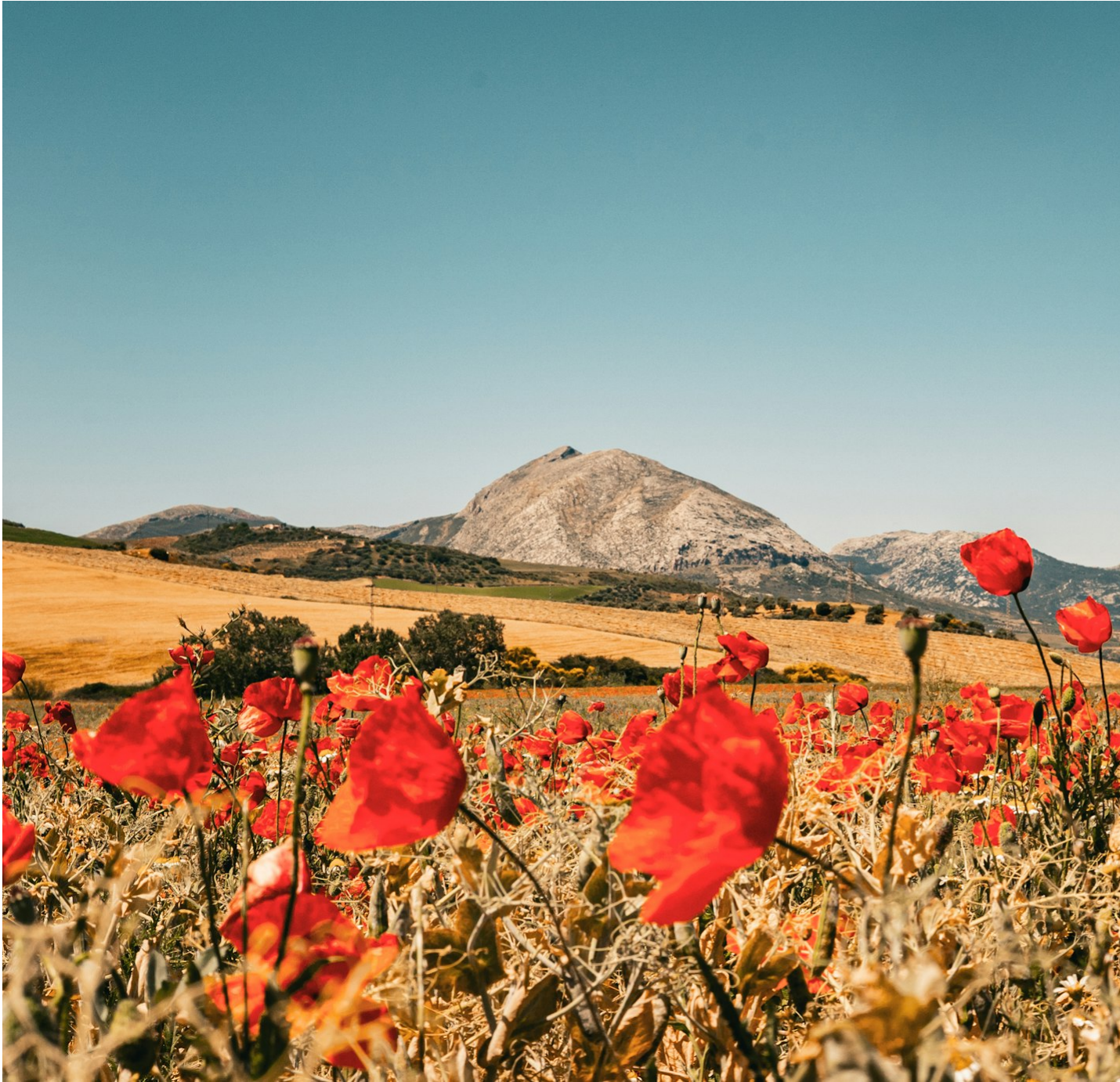
The stunning landscapes of Andalusia, Spain