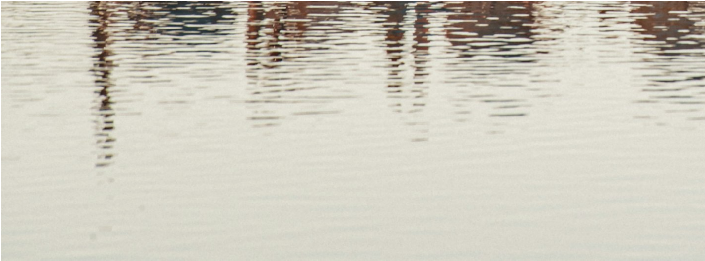
Flamingos feeding in the shallow lagoons of the Ebro Delta Natural Park

In southern Catalonia, where the mighty Ebro River meets the Mediterranean, lies one of Europe's most important wetland ecosystems. The Ebro Delta, formed by thousands of years of sediment deposition, creates a vast network of rice paddies, salt marshes, and shallow lagoons that serve as a crucial stopover for millions of migratory birds.