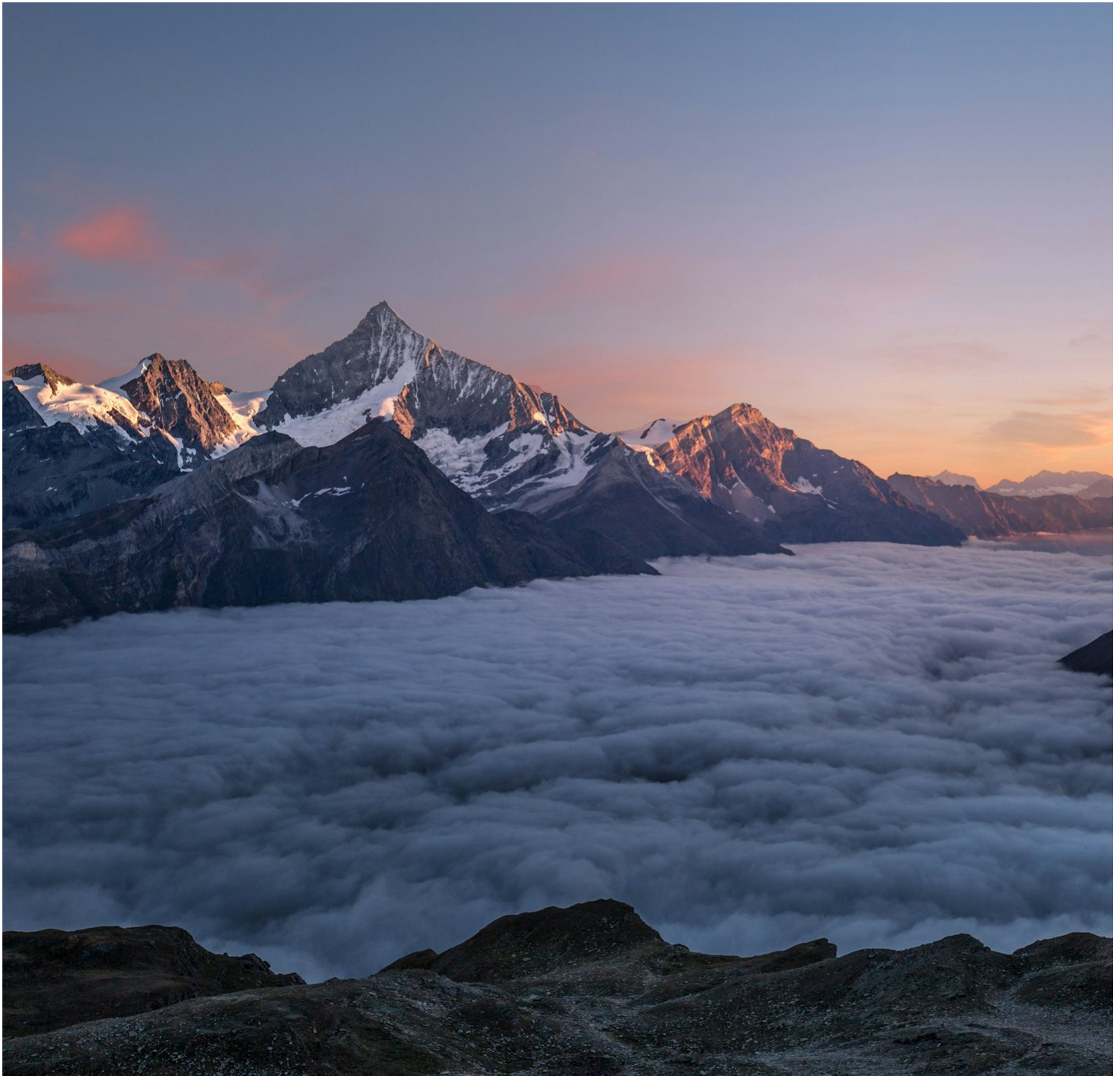
The pristine peaks of Parc Nacional d'Aigüestortes i Estany de Sant Maurici

The Catalan Pyrenees represent some of the most spectacular mountain scenery in all of Europe. The crown jewel of this region is undoubtedly the Parc Nacional d'Aigüestortes i Estany de Sant Maurici, Catalonia's only national park and a UNESCO World Heritage site that showcases the raw power and beauty of glacial landscapes.