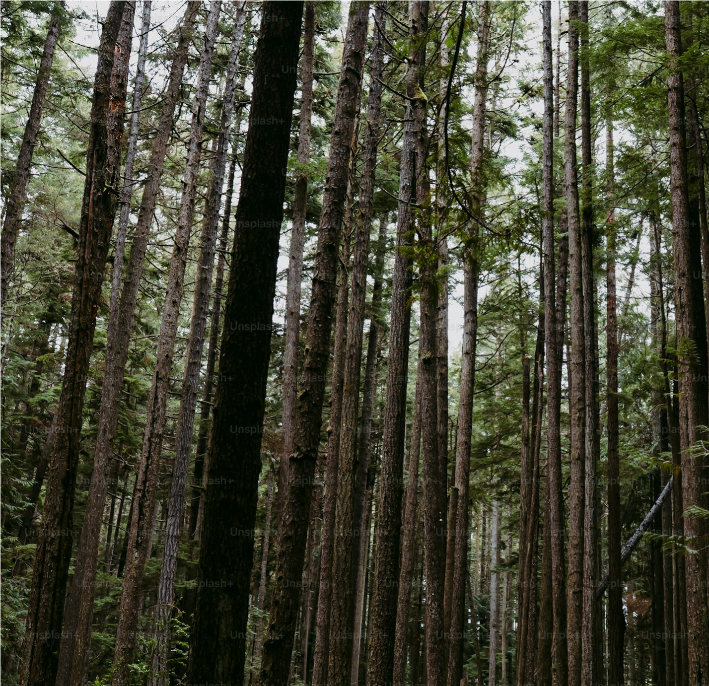
The fageda d'en Jordà, Europe's most unique beech forest growing on volcanic soil

Just offshore from the resort town of L'Estartit, the Medes Islands constitute one of the most important marine reserves in the western Mediterranean. These seven small islands and their surrounding waters harbor an incredible diversity of marine life, from colorful coral gardens to schools of barracuda and grouper. The crystal-clear waters provide visibility of up to 50 meters, making it a world-class destination for diving and snorkeling.