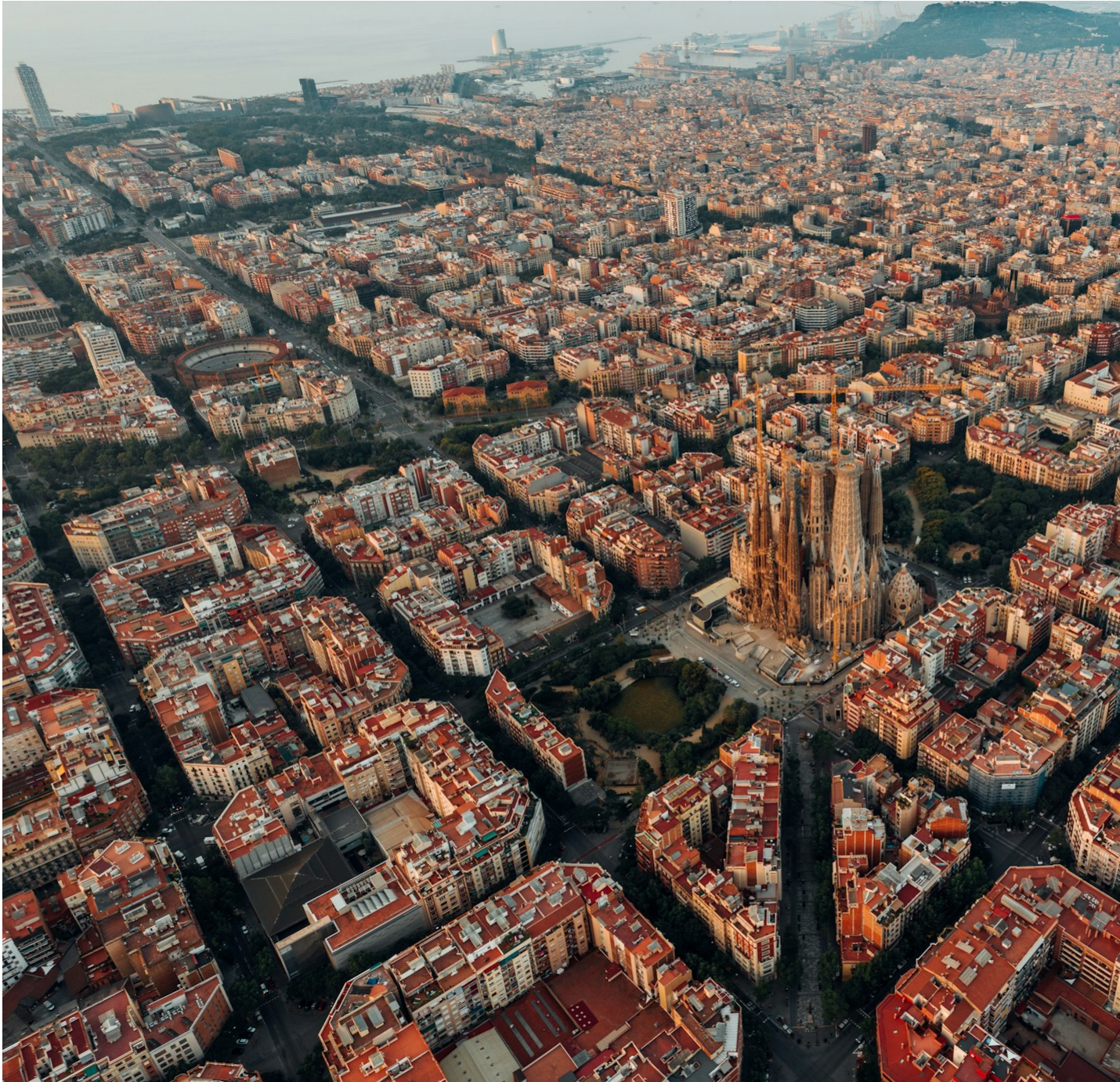
The dramatic coastline of Costa Brava, Catalonia